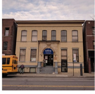
Building affordable housing with onsite social services for older adults: